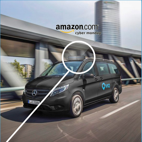
Easily mounts on cars and taxis