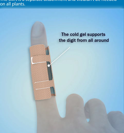
Just remove from freezer, open & wrap